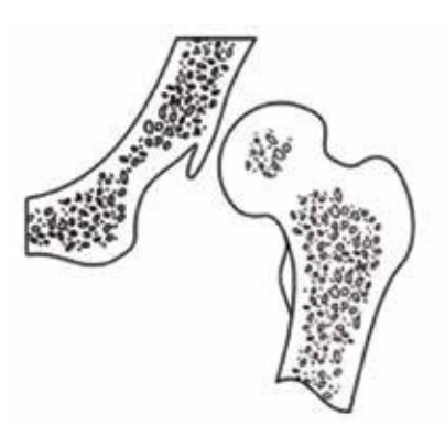
Figure 3. DDH - Dislocated hip joint